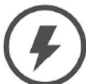
3.2 MW Capacity

Following the Capital Market Authority (CMA) approval to issue and list a long-term fixed rate Corporate Bond on Rwanda Stock Exchange (RSE), ENERGIHOTEL officially commenced its trading in August 2021.