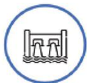
3 HPPs (Keya, Nkora & Cyimbili)