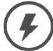
3.2 MW Capacity

Following the Capital Market Authority (CMA) approval to issue and list a long-term fixed rate Corporate Bond on Rwanda Stock Exchange (RSE), ENERGICOTEL officially commenced its trading in August 2021.