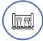
3 HPPs (Keya, Nkora & Cyimbili)